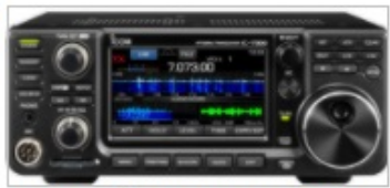
Voice & Data Transceiver with worldwide reach

We bring added fulfillment to many lives by helping local residents get ham radio licenses, gain skills and SERVE THEIR COMMUNITY with those skills & assets.