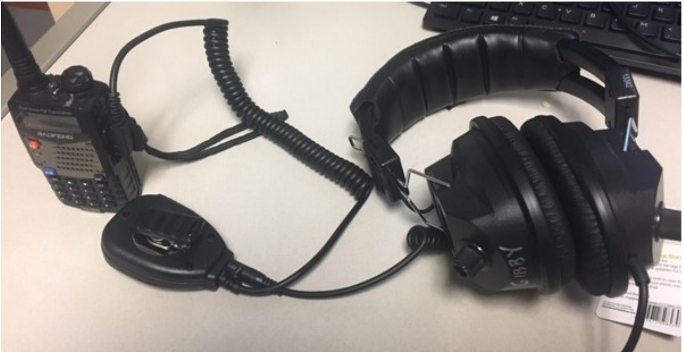
Figure 1. Plugging earphones into $6 baofeng microphone

The photo above shows how to use earphones/headset with the Baofeng UV-5R. You must plug the earphone into the 3.5mm (1/8") jack on the microphone – you can't plug normal headphones into a Baofeng unless they have the smaller plug, because of the jacks on the side of the UV-5r, the smaller one is the earphone – the 3.5 (1/8") jack is actually for the microphone as shown in Figure 2 below.