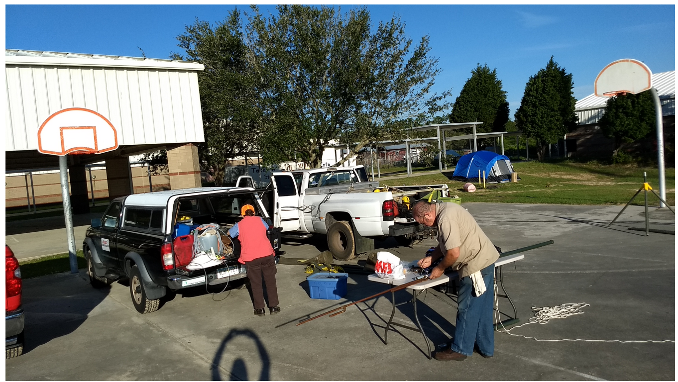
Alachua County volunteers constructing antennas at a hurricane shelter.

The North Central Florida Amateur Radio Club would like to acknowledge all the work done by the deployed volunteers and other officials who labored to respond in the wake of Hurricane Michael, and especially the reports submitted by Alachua County volunteers to help document the events and issues encountered.