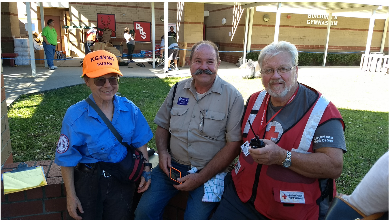
Alachua County volunteers with a shelter manager.